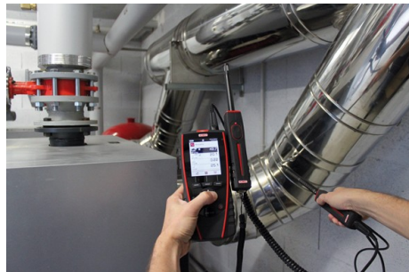
Hygrometry and air velocity measurement