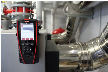
Climatic conditions measurement

AMI 310 SK : portable supplied with a ±500 Pa pressure module, a telescopic hotwire probe with gooseneck, a Ø6 mm Pitot tube, 2 x 1 m of silicone tube, a stainless steel tip